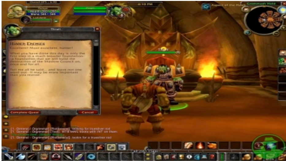
World of Warcraft

case, fantasy and the players create characters with a race, class and stats to represent their fighting abilities. In addition to the aim of going on quests and defeating adversaries in order to level up in experience, leading to better weapon and spells, there is an overarching narrative, which allows players to feel they are part a grand plot. WoW also has its own economy, and the buying and selling of items found in the world is a major part of the gameplay. Being a game-based world, it is not possible to customise the environment or build simple objects. While seemingly having limited educational potential, a large body of research has focused on WoW and other MMORPGs, specifically looking at how they can be used to offer insight into social skills and social learning, management skills, economics and language learning (Kadokia, 2005; de Freitas, 2006a; 2006b; 2008b; Warmelink, 2007; Facer et al, 2007; Wagner, 2008) . To play WoW, the user needs firstly, to purchase the software package on DVD and then pay a monthly fee for access to the game servers.